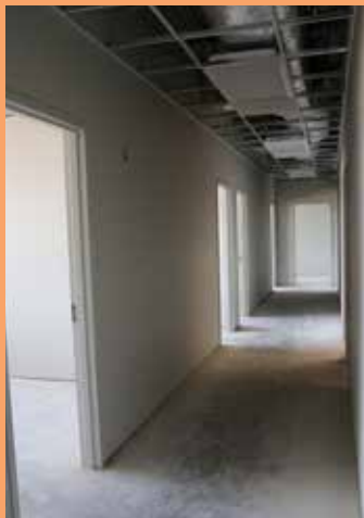
A view into the hallway

The renovation is nearing completion, and stakeholders and foundations have been touring the renovated areas in mid-construction. This has provided many opportunities for input and support as we begin work on the finishing touches. The vision of the Center put forth in drawings and blueprints is now materializing as walls go up and the exterior pavement is laid.