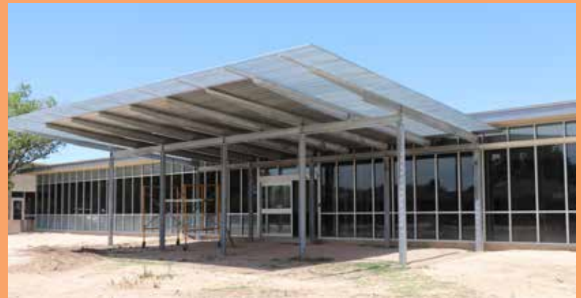
A view of the front of the building